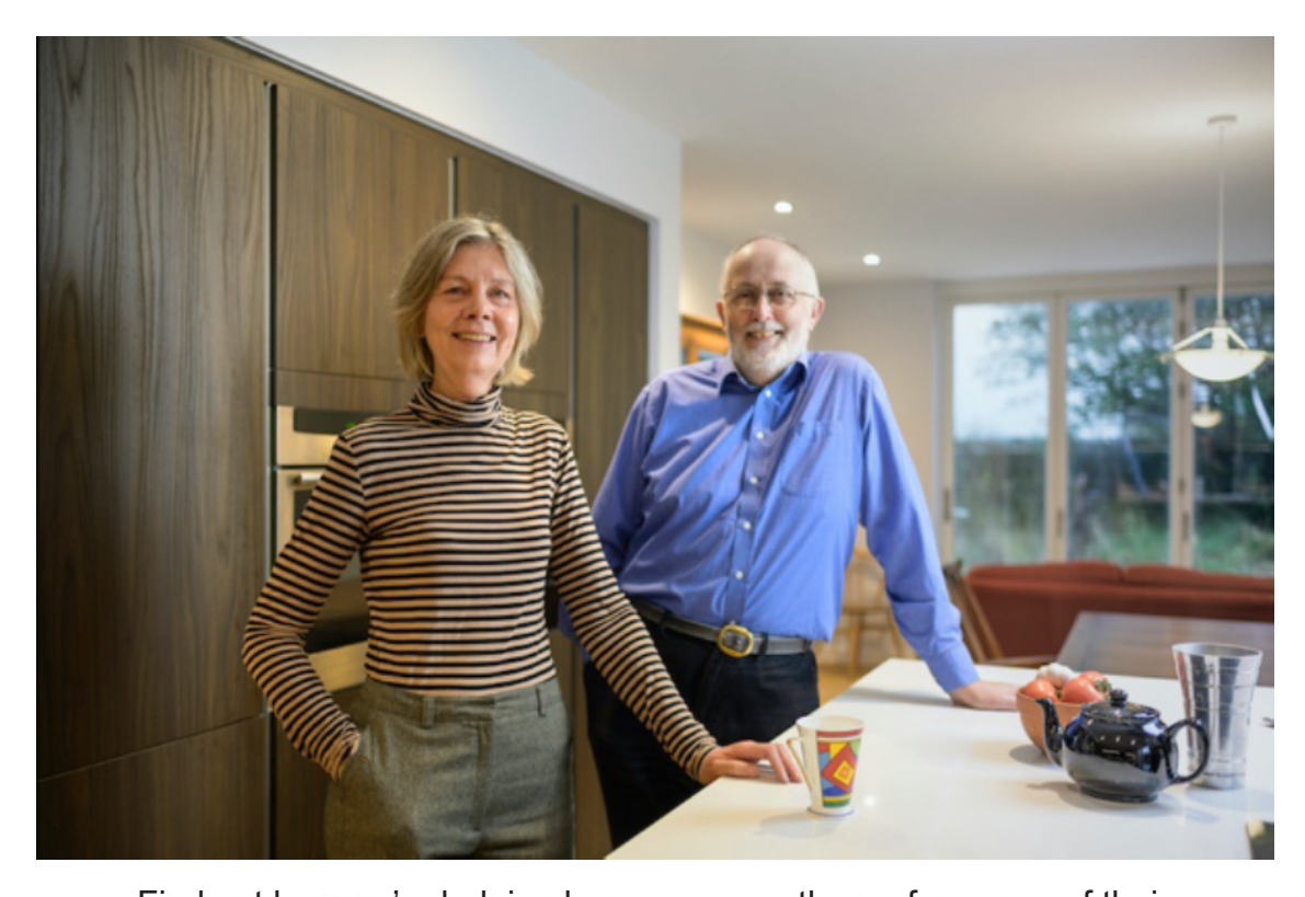
Find out how we're helping homes assess the performance of their