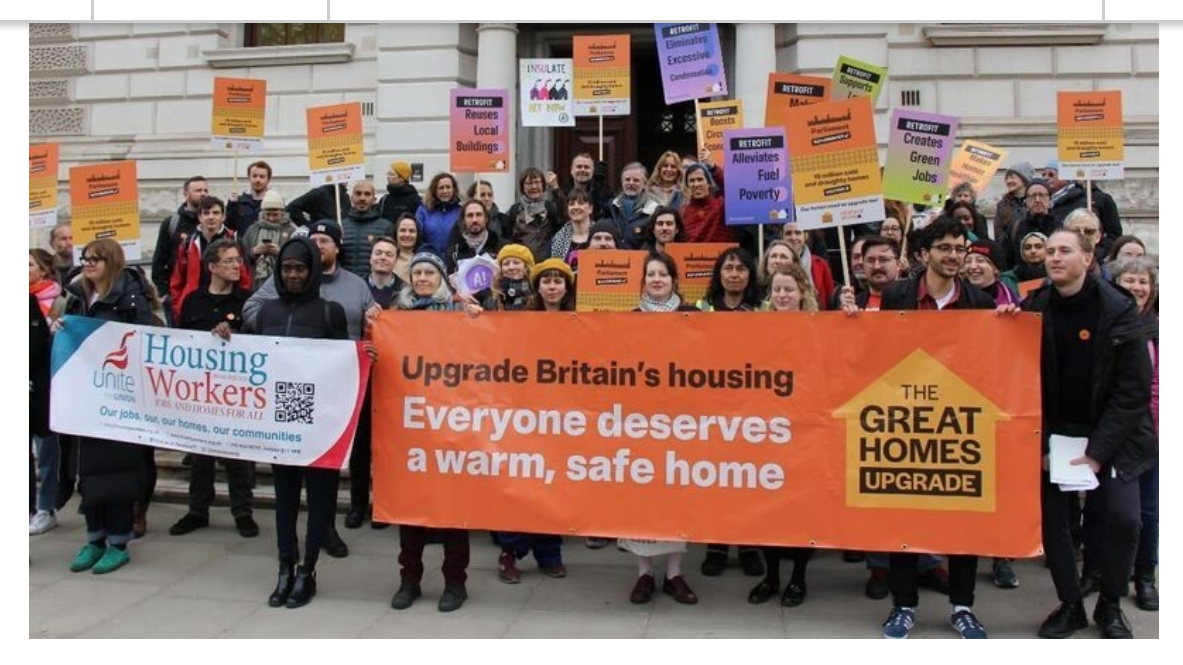
National Energy Foundation took part in the Great Homes Upgrade Campaign

The price cap has just risen, and there is very likely going to be another rise in October, quite apart from the market volatility due to other reasons. No wonder RSLs (registered social providers) and individual homeowners are throwing their weight behind green retrofit wherever possible. This could be one of the reasons why our resident member numbers have increased by a whopping 300% and you can also join us!