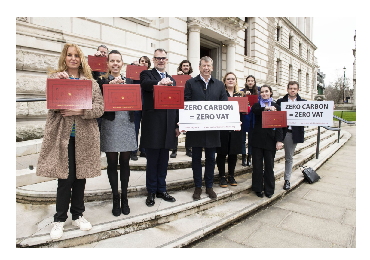
SuperHomes campaigns with other groups for retrofit outside HM Treasury